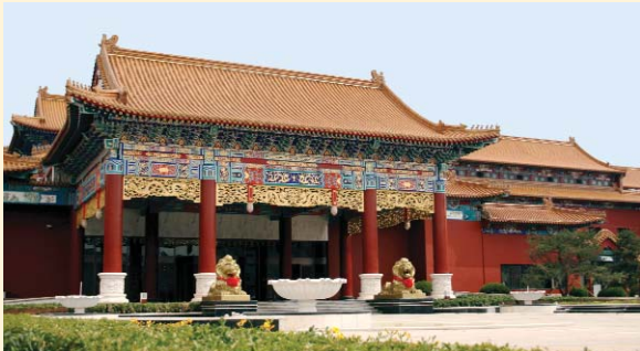
Leisure City International Hotel

All Sport Management Program travel arrangements will be managed by Cartan, an Authorized Summer Games Travel Company for thirty-one countries throughout North America, South America and the Caribbean. The highly experienced Cartan on-site staff will ensure that your Summer Games Sports Management experience is pleasurable and convenient. Cartan currently operates a field office in Beijing in preparation for the 2008 Beijing Games and will provide daily on-site service for program members throughout the duration of your stay.